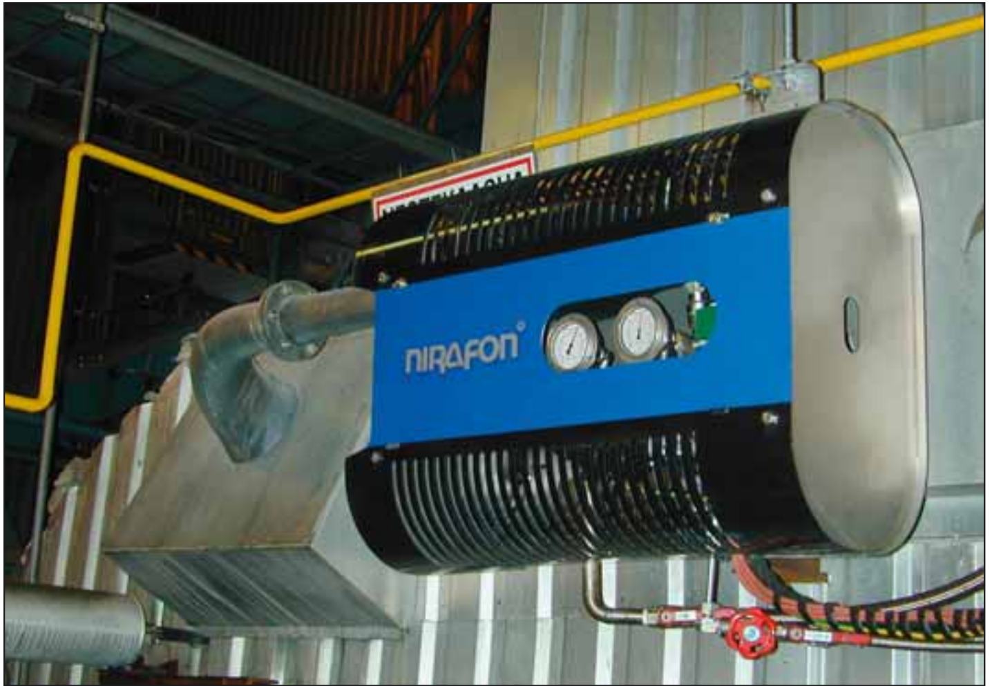
The new NCSD acoustic cleaner installed in the flue of the black liquor recovery boiler at the fluting factory of Stora Enso in Heinola